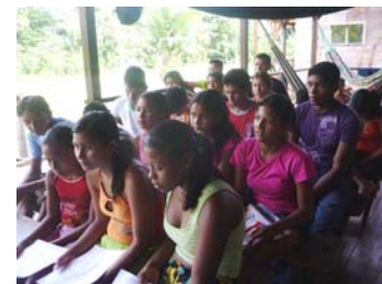
Students at the J.W. Marriott, Jr. School in Boa Frente

The Amazonas State Research Support Foundation has provided grants to 25 Juma community members to conduct rainforest research that will ultimately help demonstrate the nutritional, medical and economic benefits of rainforest protection. The six-month program is managed by FAS and features guidance from the local J.W. Marriott, Jr. School teachers as well as visiting nutrition and botanical experts. Research generated by the students focuses on medicinal plants, assessing and addressing local nutritional needs, the commercial potential of Brazil nuts, and the nutritional properties of Camu Camu (a local fruit rich in vitamin C). The students will report their findings to FAS and the Reserve's families in February 2011.