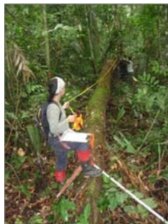
Monitoring and evaluation at the Juma Sustainable Development Reserve