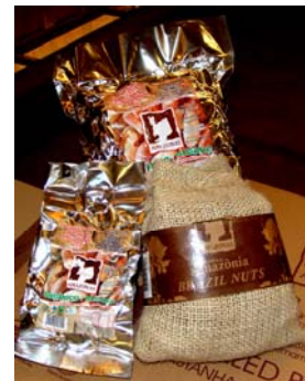
Juma harvested nuts head to local markets

Juma residents attended their first workshop on Brazil nut production last year and the first harvest is now in markets in Brazil. Sam's Clubs, a division of Wal-Mart Stores Inc., have begun selling the nuts and the Renaissance São Paulo hotel plans to feature them in their turndown service and as an ingredient in several menu items as part of efforts to raise awareness and funds for the Juma Reserve.