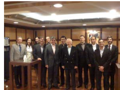
FAS representatives met with Marriott's South America Business Council at the Renaissance São Paulo